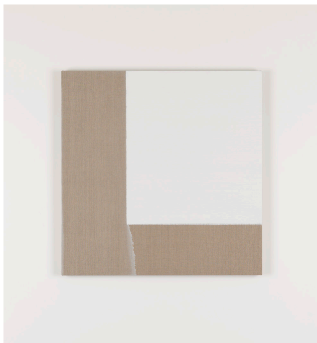
Exposed Painting Titanium White © Callum Innes

Opening in the presence of the artist: 14 September 2017 7:30 p.m.–9 p.m.